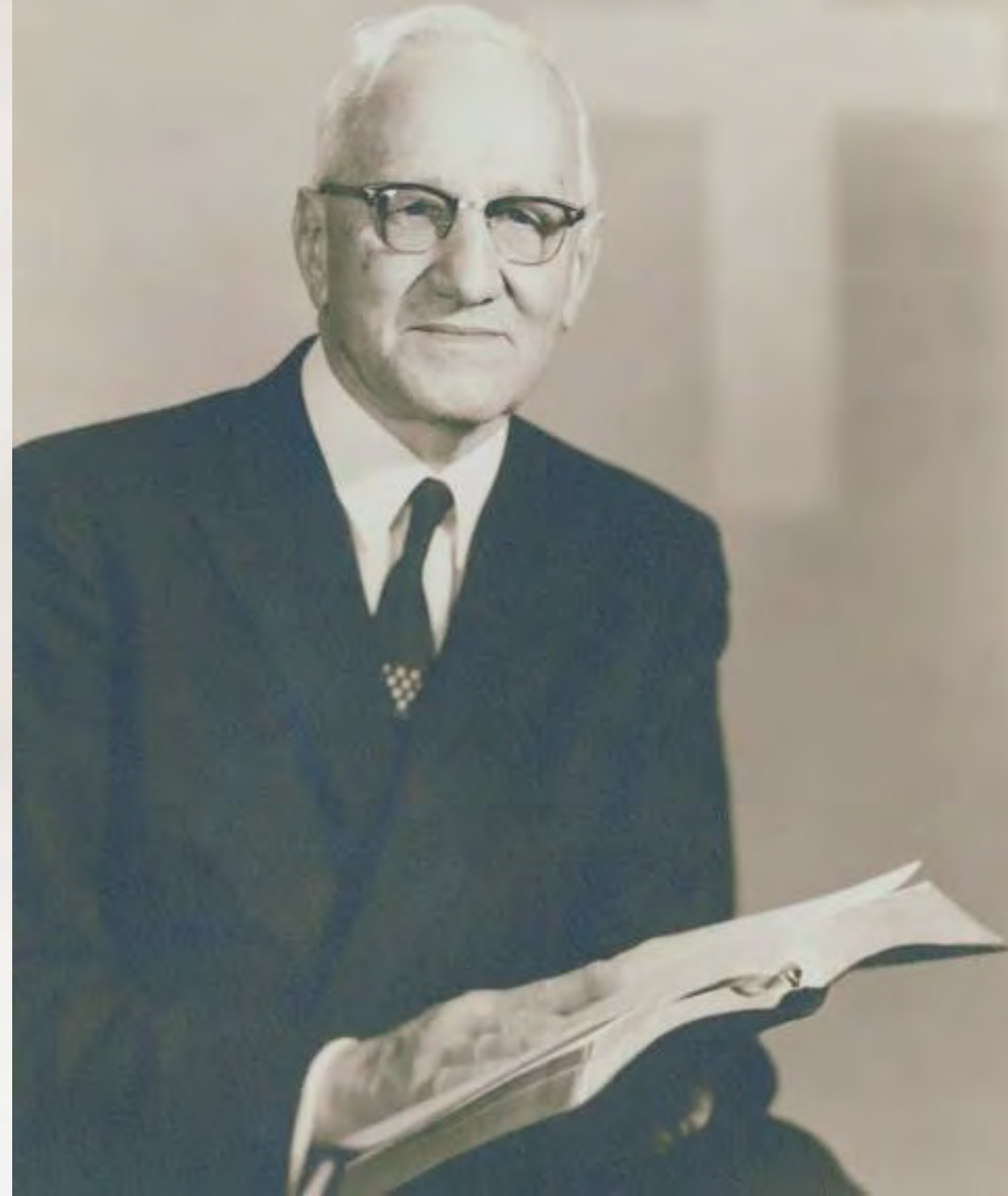
E. Stanley Jones