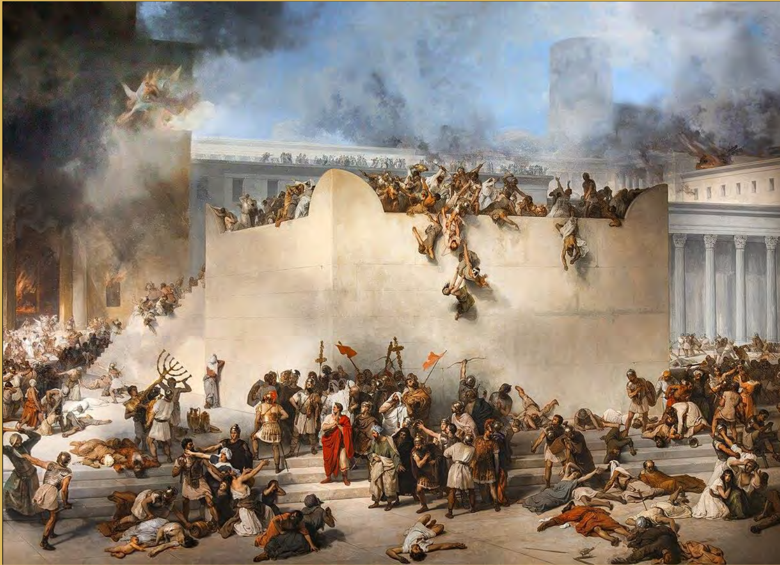
Francesco Hayez 1867