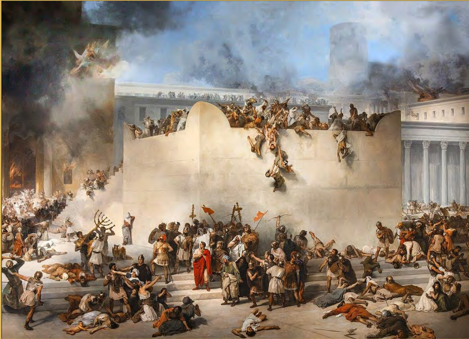
Francesco Hayez 1867

How often would I have gathered your children together as a hen gathers her brood under her wings!