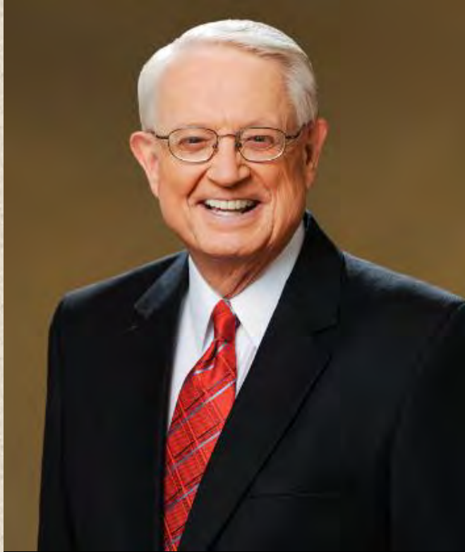
Charles R. Swindoll

“Whether Catholic, Protestant, Jewish... corruption of God’s plan sadly happens in all denominations, in all religions, in all countries, in all times.