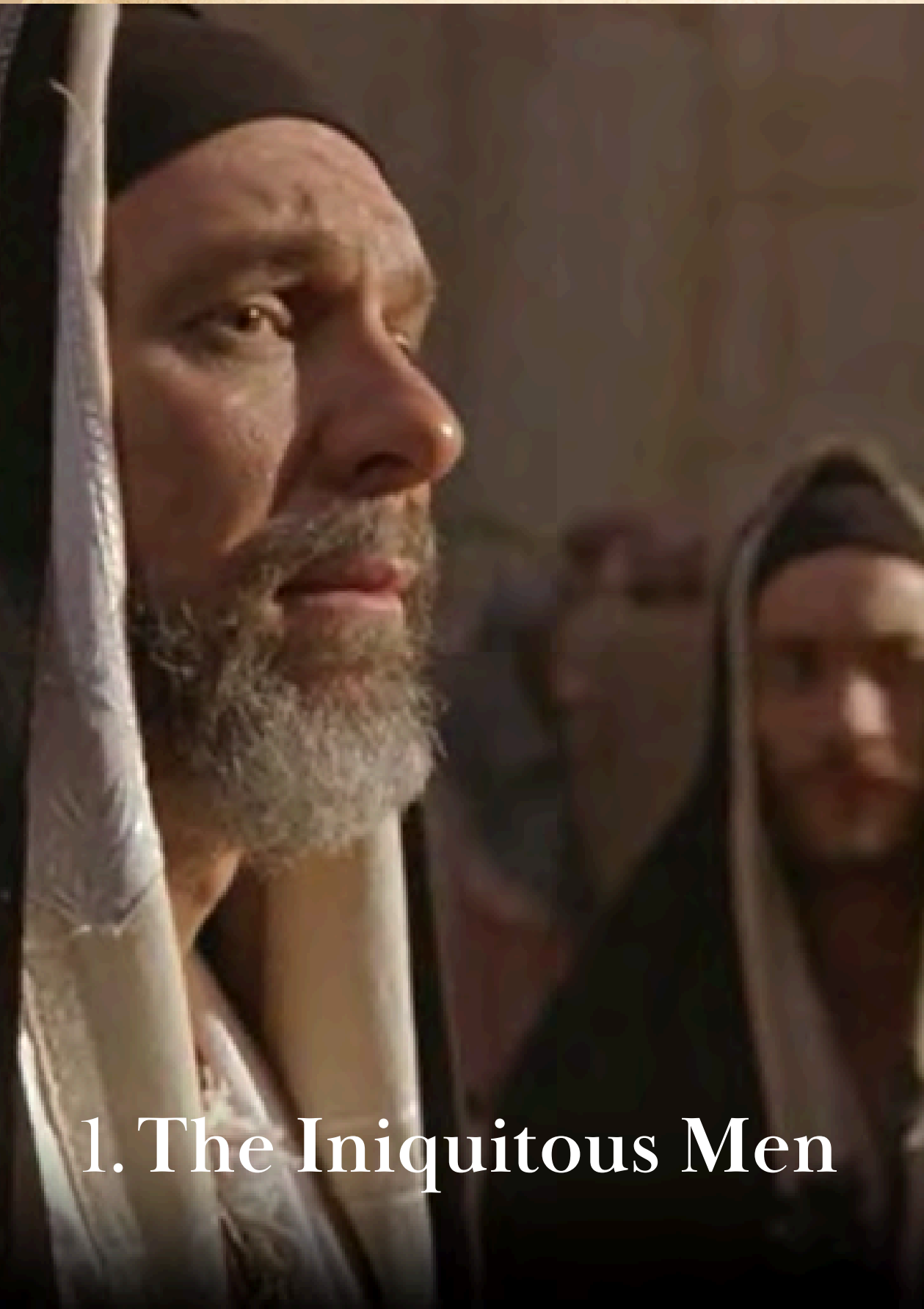
1. The Iniquitous Men