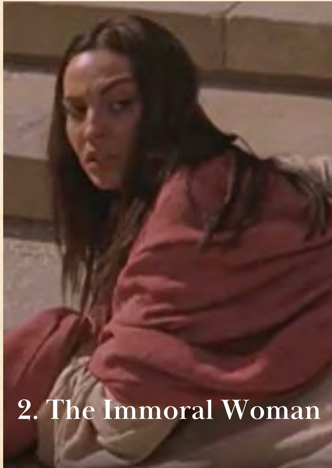
2. The Immoral Woman