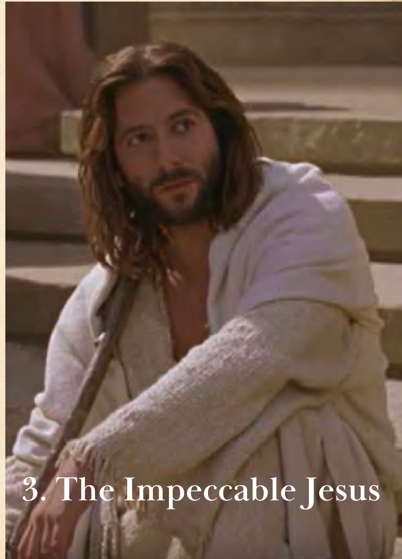
3. The Impeccable Jesus