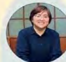
Breakout 5: Walk Ye in it