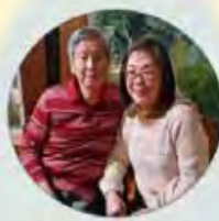
Breakout 2: Serving the Elderly in Shiga