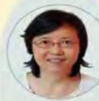
Breakout 3: University Ministry