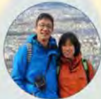
Breakout 1: Serving in a Japanese Church

Venue: Kum Yan Methodist Church, The Living Room, Level 6