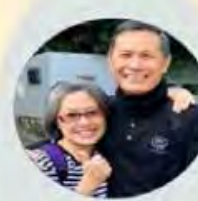
Breakout 4: Family & Children's Ministry