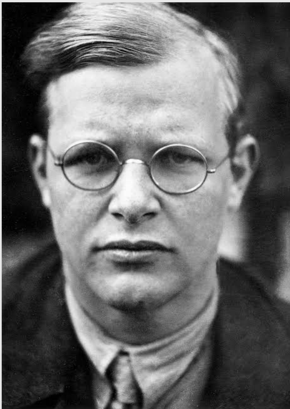
DIETRICH BONHOEFFER German Theologian 4 Feb 1906 - 9 Apr 1945