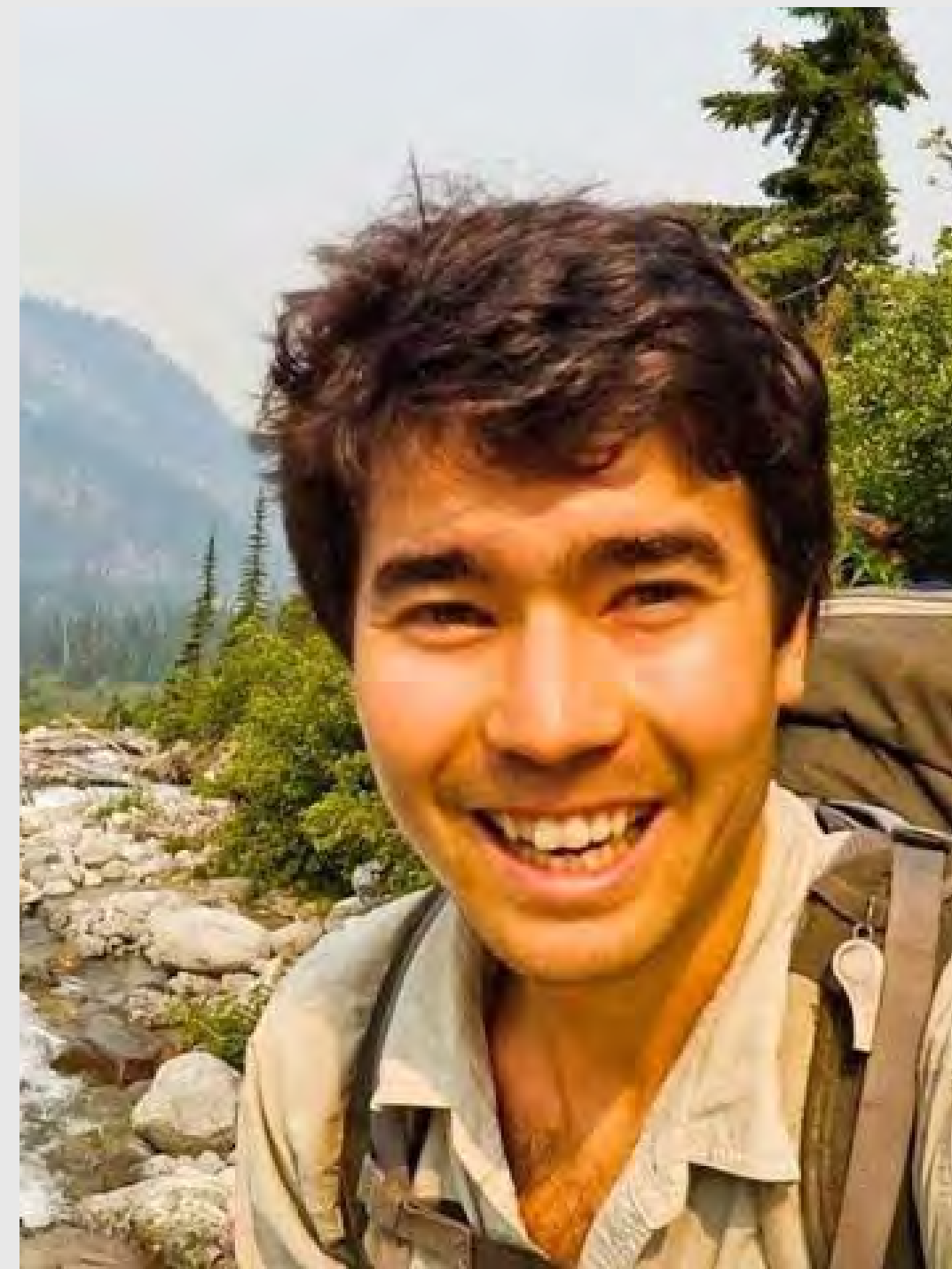
JOHN ALLEN CHAU American Missionary 18 Dec 1991 - 17 Nov 2018